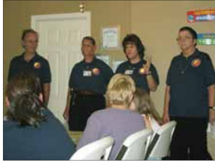
Abuse Prevention Team, 2008

All individuals have the right to live free of sexual abuse and sexual harassment. All staff and persons with developmental disabilities will receive education and training regarding early identification of suspected abuse, abuse prevention, reporting, and accessing appropriate services.