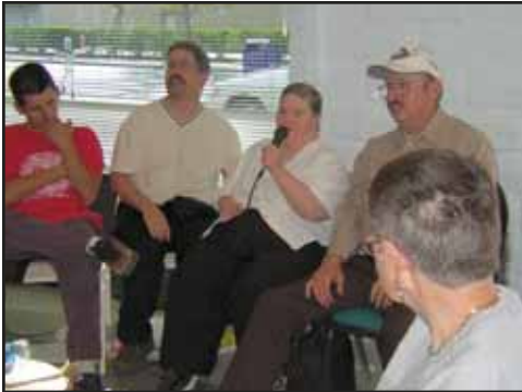
People First Peer Trainers, 2002

All agencies providing services to persons with developmental disabilities will provide training to ensure that their staff are competent in responding to the needs of persons with developmental disabilities in the areas of safety, health, relationships, self-esteem, and sexuality.